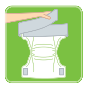
Fully open up the pad. Shape the pad into a bowl shape.