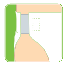
Stretch the front of the pad up towards the waist and out at each side. Attach the hookwith soft pressure.